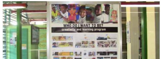
National Library. Exposition Willemstad, 2018

In 2015 Ideo Arte expanded to Willemstad, Netherland Antilles, running several projects at the schools Chaya Willems and Albert Schweitzer HAVO/VWO. The results confirm the universal value of arts in children. With 220 students assisting.