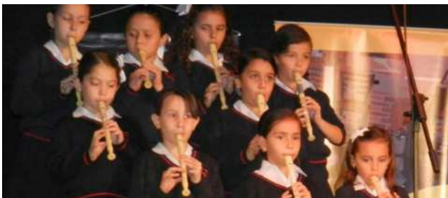
Concert and live recording, Cristo Rey school, 2012