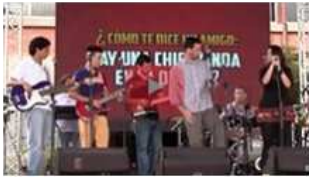
Hit the road Jack / Ray Charles / Claret