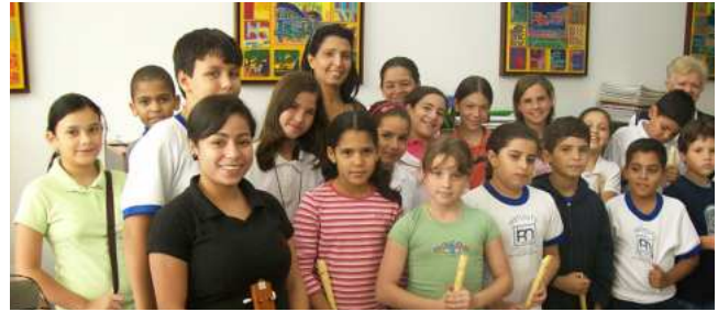
Arturo Michelena school at Ideo Arte headquarters 07