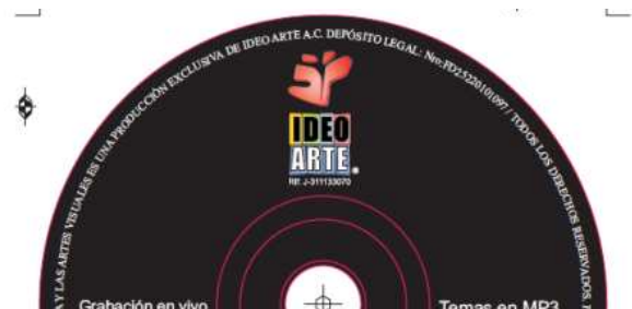
Mixed and mastered disc in Optilazer