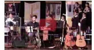
Autum Leaves / Joseph Kosma – Jacques Prévert