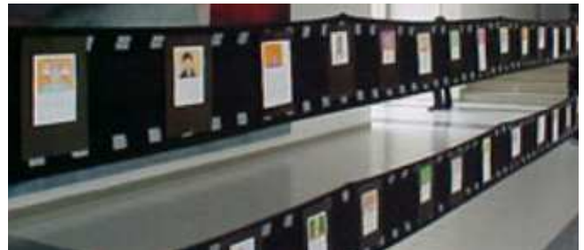
Animated self-portrait exhibition. Jefferson school, 06