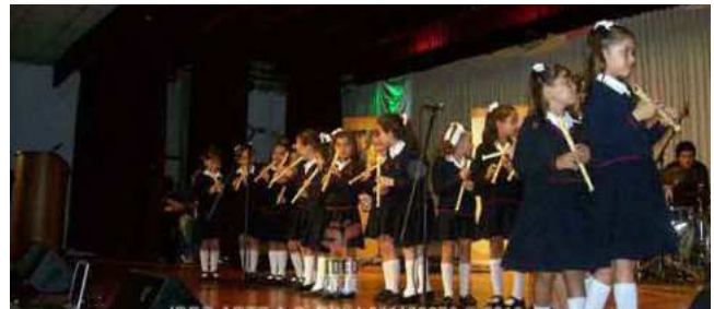
Canigua school, live recording for the disc, 2011