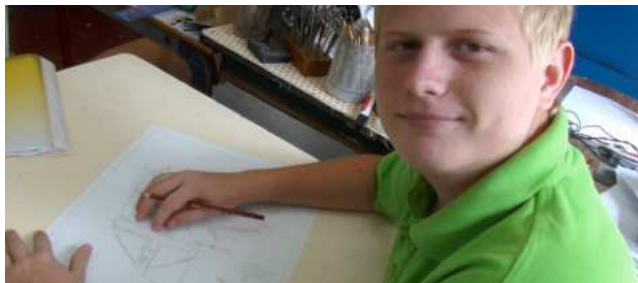
School Dr. Albert Schweitzer HAVO/VWO, 2019