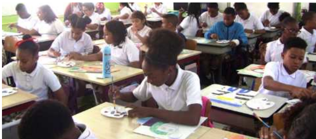
Chaya W school, children during Ideo Arte workshop