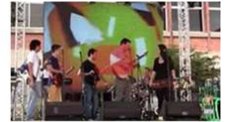
Bound to you / Christina Aguilera