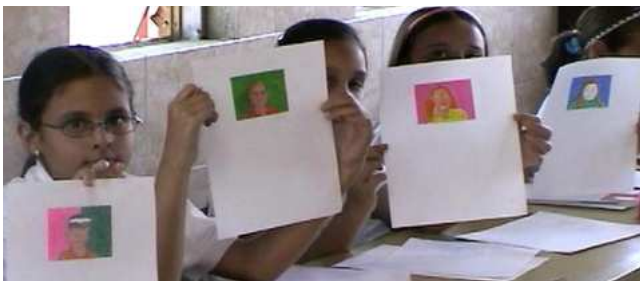
Arturo Michelena school, 2003