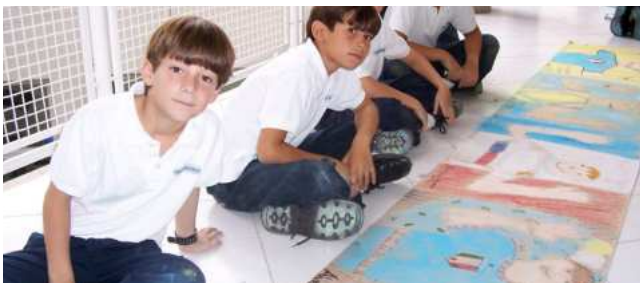
Jefferson school, 2006