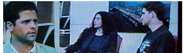
Entre Amigos, Merida. La Buena Gripe 2000

“Ideo Arte” (Why Art?) was founded in 2004, following the original approach but focused on mass services for schools. The focus was to compensate for the system where arts are seen as secondary disciplines and without major importance. As of today (2020), 5105 students have successfully passed through this course.