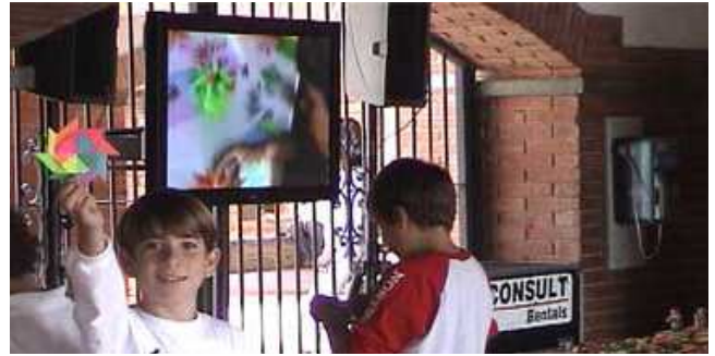
Los Arcos school, 2003