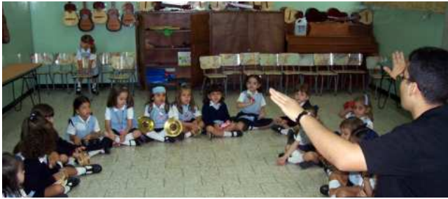
Cristo Rey de Altamira school, 2003