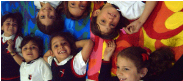
Canigua school, 2002