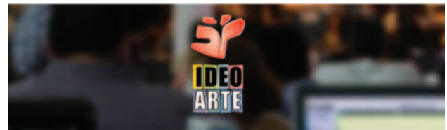
Operations in schools of Caracas, 2004 - 2015

“Ideo Arte” (Why Art?) was founded in 2004, following the original approach but focused on mass services for schools. The focus was to compensate for the system where arts are seen as secondary disciplines and without major importance. As of today (2020), 5105 students have successfully passed through this course.