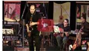
Blue Bossa / Kenny Dorhan