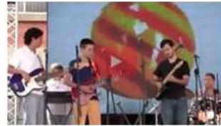
G Blues / Standard Jazz