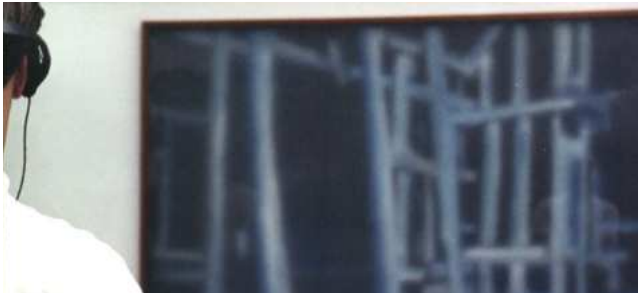
“Origin of Access” oil painting - Plexiglass Audio, 1999