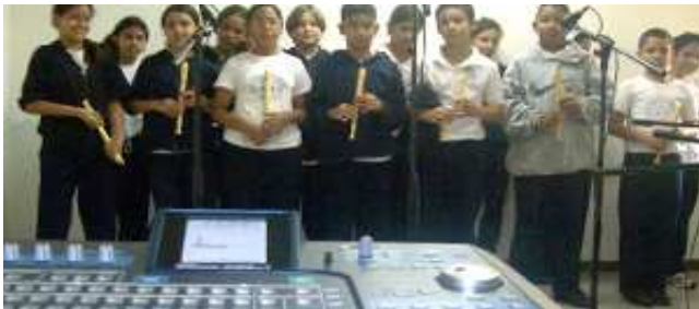
ADS school, recording for the disc, 2007