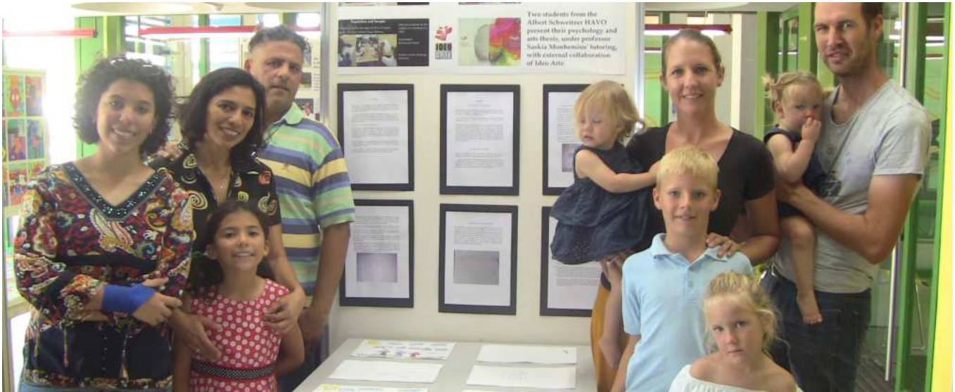
Exhibition at the National Library, Willemstad 2018. Schools: Chaya Willems and Albert Schweitzer HAVO/VWO. Parther: Diocese of Willemstad. Sponsored by ADS Curacao, Prins Bernhard Found, Korpodeko, and Red Cross.