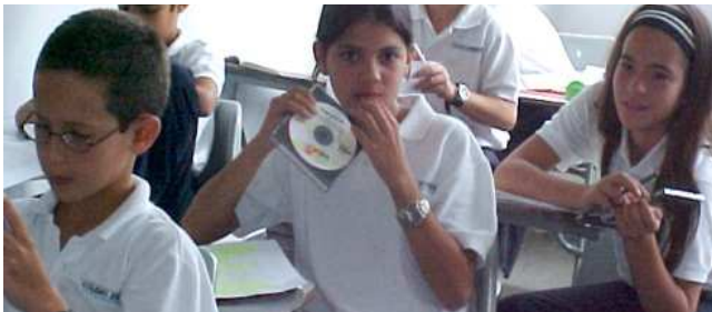
Jefferson school, animation results on CD