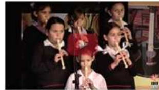
Beyond the sea / Charles Trenet – Jack Laurence