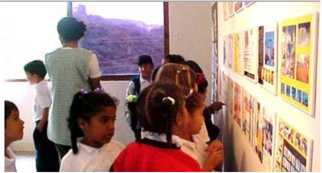
Exhibition of La Buena Gripe at the ADS school