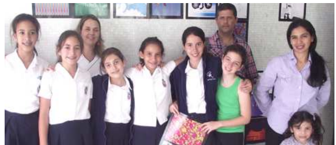
Cristo Rey de Altamira school, 2014