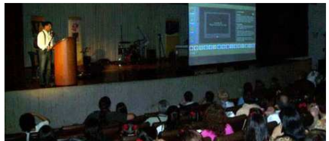
Multimedia CD of arts and music, live presentation, 09