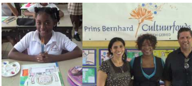
Prins Bernhard Cultuurfonds -Chaya W school