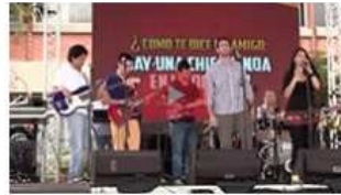
I'm a believer / The Monkeys